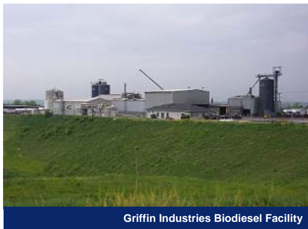
Griffin Industries Biodiesel Facility