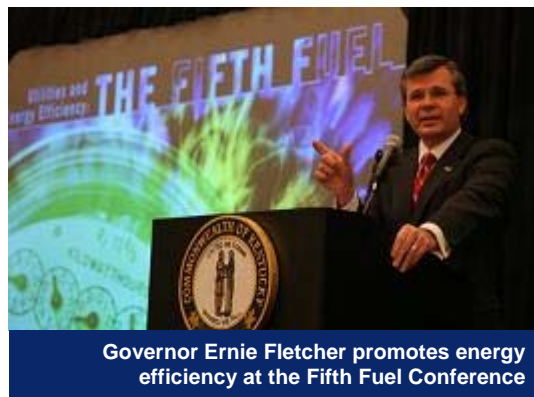
Governor Ernie Fletcher promotes energy efficiency at the Fifth Fuel Conference

The conference was organized by the GOEP and Duke Energy. Participants discussed initiatives that can be undertaken in Kentucky to address the challenges to increasing energy efficiency and consumer awareness.