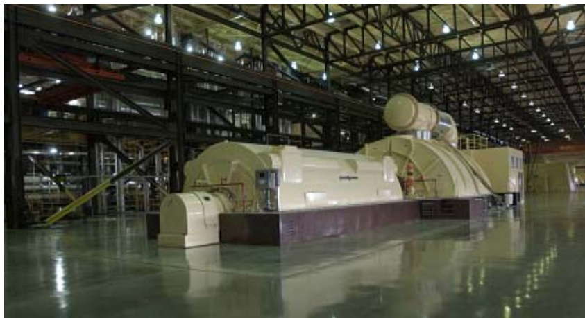
The 268-megawatt Gilbert Unit, a circulating fluidized bed boiler generator that began operation in 2005 at Spurlock Station in Maysville.