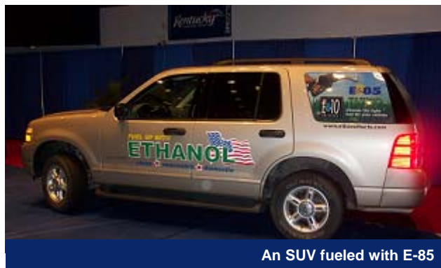
An SUV fueled with E-85

Awards for Energy Achievement - On June 13, 2005, GOEP presented two awards for outstanding energy achievement at the Pennyryle Area Development District Annual banquet in Hopkinsville. The 2005 W.W. "Bill" Bryan Memorial Award went to Commonwealth Agr-Energy of Hopkinsville, an ethanol plant cooperatively owned by 2,300 farmers in a 20-county region. The facility produces 23 million gallons of fuel grade ethanol annually. The plant was featured in the subscriber's edition of Time magazine.