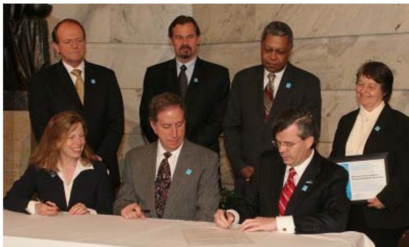
Governor Ernie Fletcher at the ENERGY STAR awards.

- On March 30, 2006 Governor Fletcher and representatives from the Environmental Protection Agency (U.S. EPA) and the U.S. Department of Energy (U.S. DOE) recognized GE Consumer & Industrial of Louisville, Toyota Motor Manufacturing North America of Erlanger, the Governor's Office of Energy Policy (GOEP), and the McCreary County Community Housing Development Corporation for their outstanding contribution to the ENERGY STAR