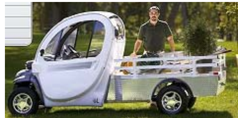
All-Electric Utility Vehicle

Since they weigh less, they will do very little or no damage to the grounds where utilized. These could eliminate similar gas-powered vehicles across the state. The 2007 versions move to a 1,400 lb. payload capacity, so they will carry more, utilize no gasoline, and be virtually maintenance free. This is all accomplished at nearly the same cost as comparable gas-powered vehicles, and over the lifecycle will cost much less. Plus they are quiet and pollution free.