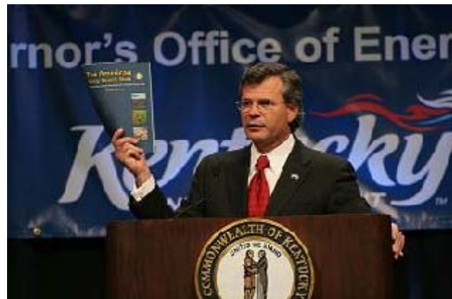
Governor Ernie Fletcher promotes Energy Security at the Energy Policy Summit